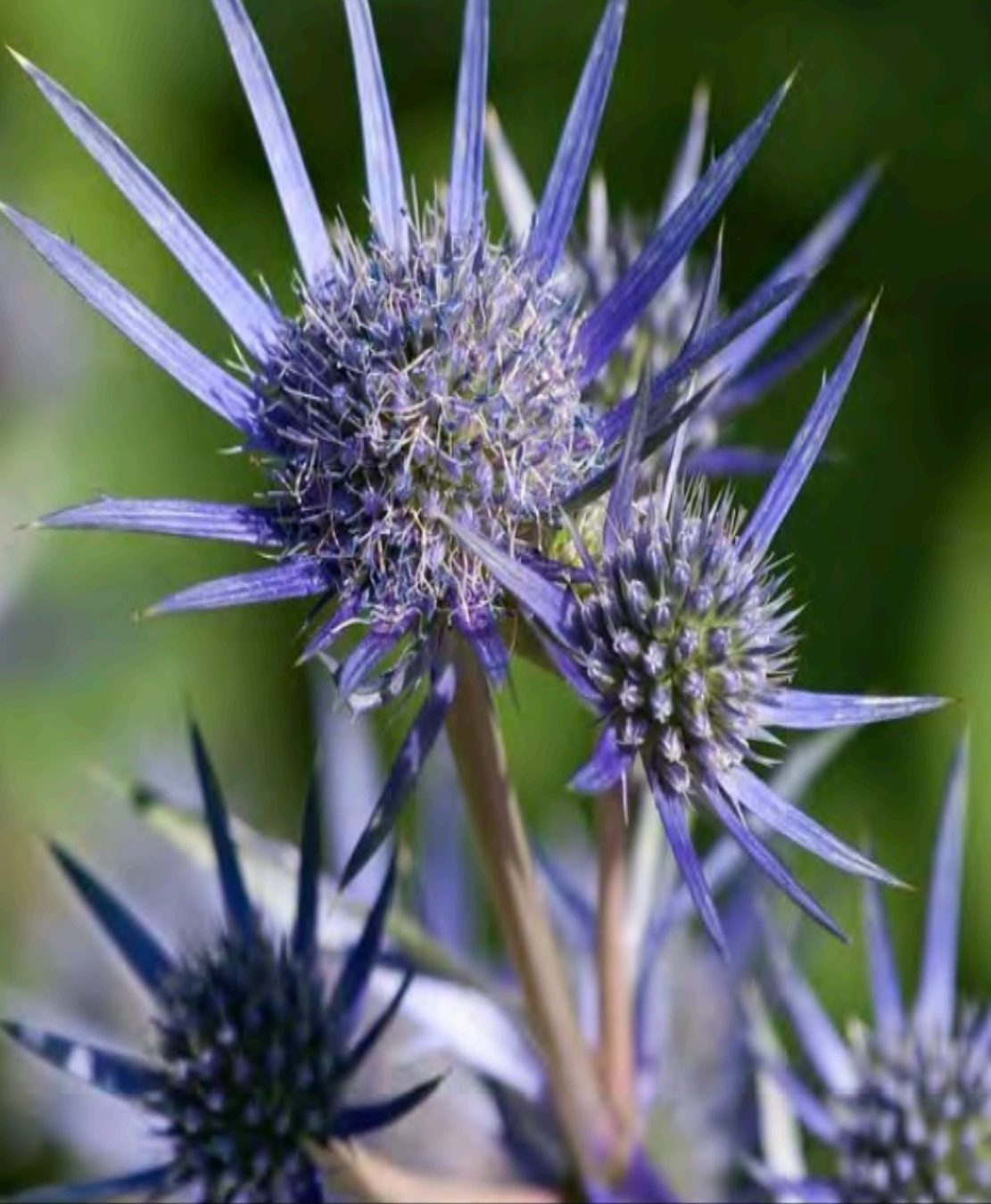
RHS Wisley The Wellbeing Garden