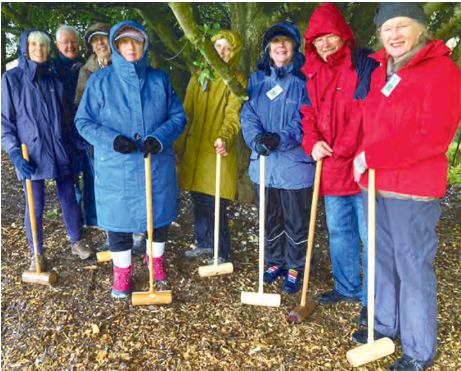
From one weather extreme to another

June Update: We are now an established golf croquet group of twelve, albeit with a slightly different configuration of members to those in the first photo. Some have left due to other commitments but we've welcomed new members too. The photo on the right was taken on a scorching day, regular water breaks in the shade were a necessity. We play every Tuesday and like every group, attendance numbers fluctuate due to grandchildren duties, medical