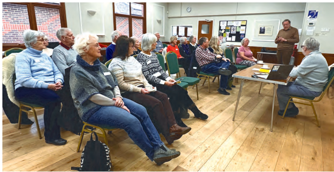
New members meeting at the end of January. How many here will be involved in running our u3a in the years to come?